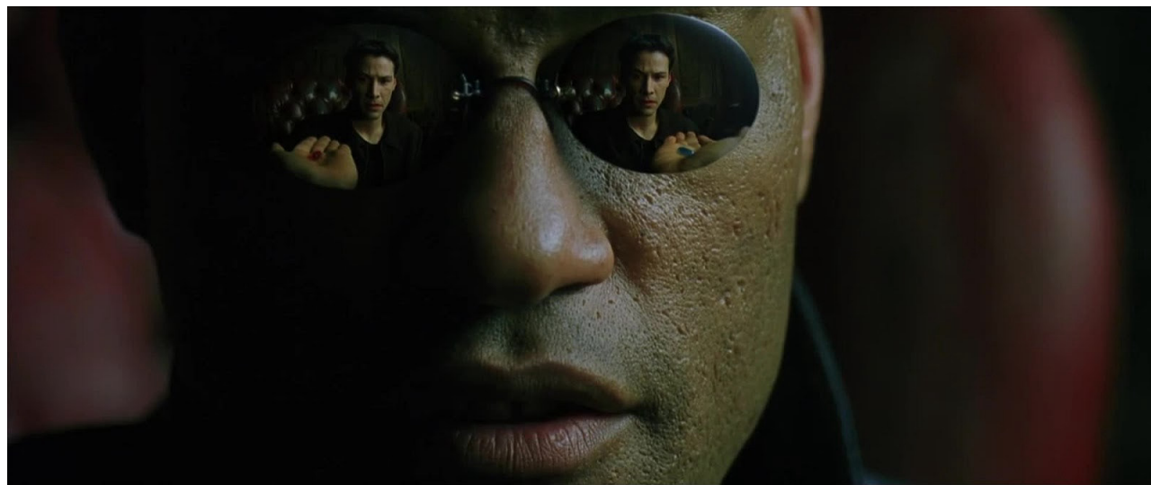
Figure 2. Screenshot from The Matrix .

One later example emerges in The Matrix (1999), arguably the most successful cyberpunk movie to date. The outlaws of Nebuchadnezzar face a force of totalizing normalcy, as machines seek to keep humanity lulled in virtual battery-acid dreams. The thematic resonance of the mirrorshades is clear in figure 2. Neo, making his choice between the red and blue pill, sees his possible futures and potential reflected back at him from the outlaw guru Morpheus’s lenses. As such, the Stoic, mysterious, black-clad counterculture man with shades to hide his dangerousness remains a cyberpunk archetype.